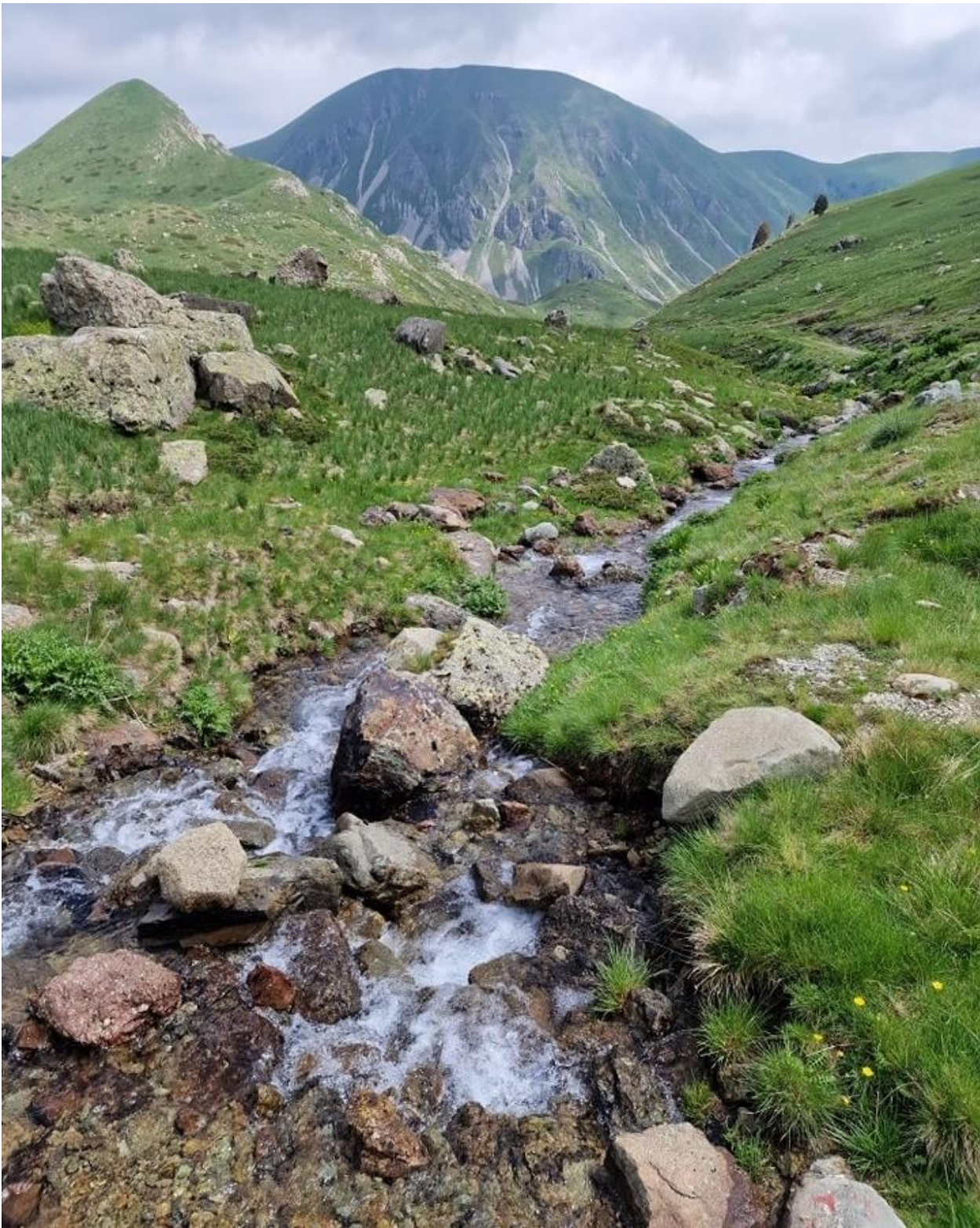
During the hike before reaching Lake 1