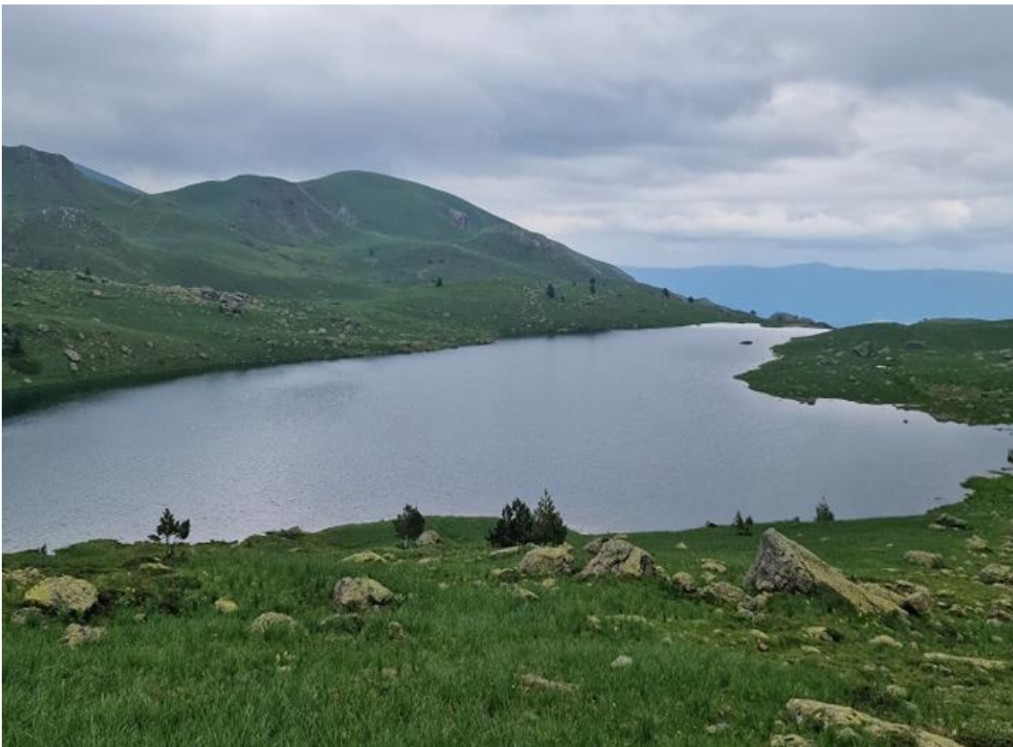
Lake no 2 Big Podgorecko Lake