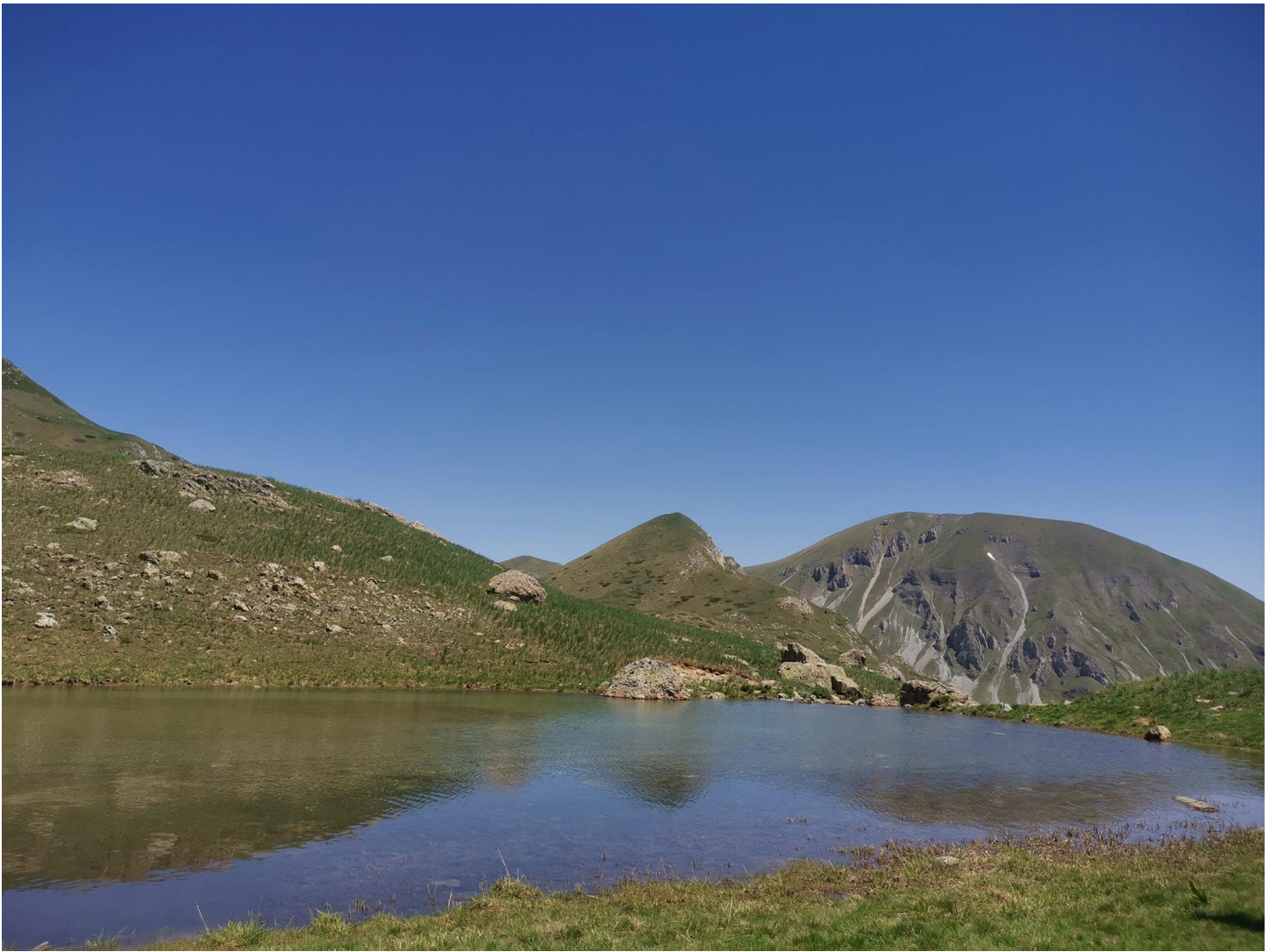
Lake No 1. Labunisko Ezero.