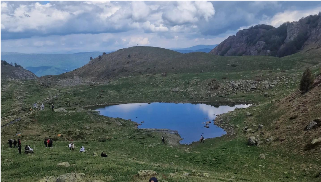
Other small lake