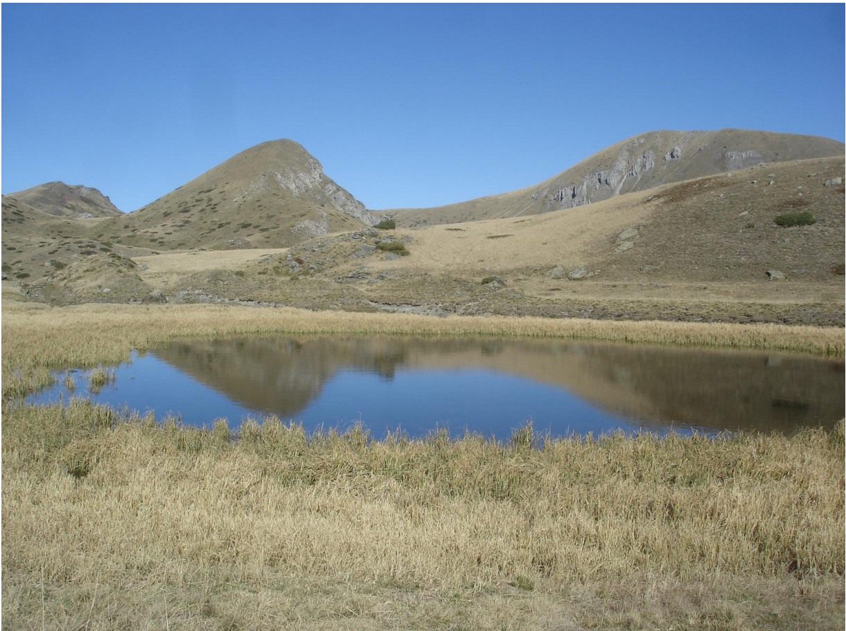
Other Small lake