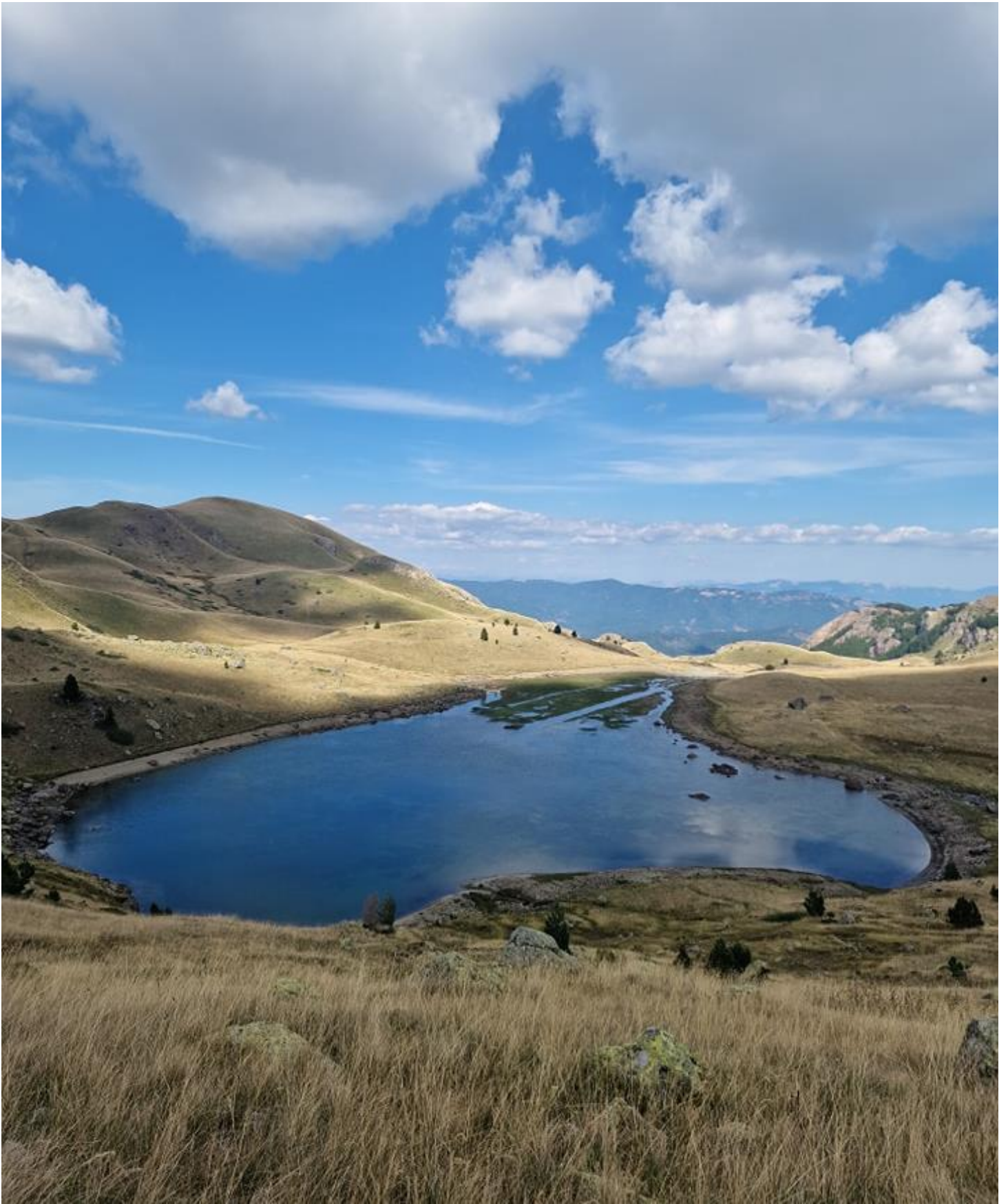
Podgorci Lake from the top