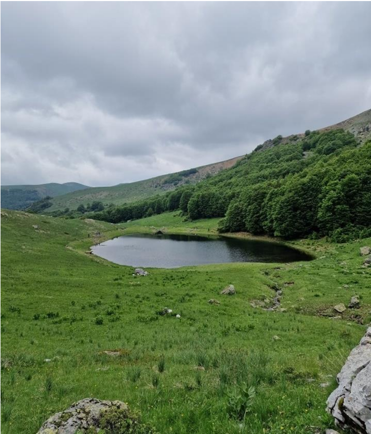
LAKE 4 Albanian site