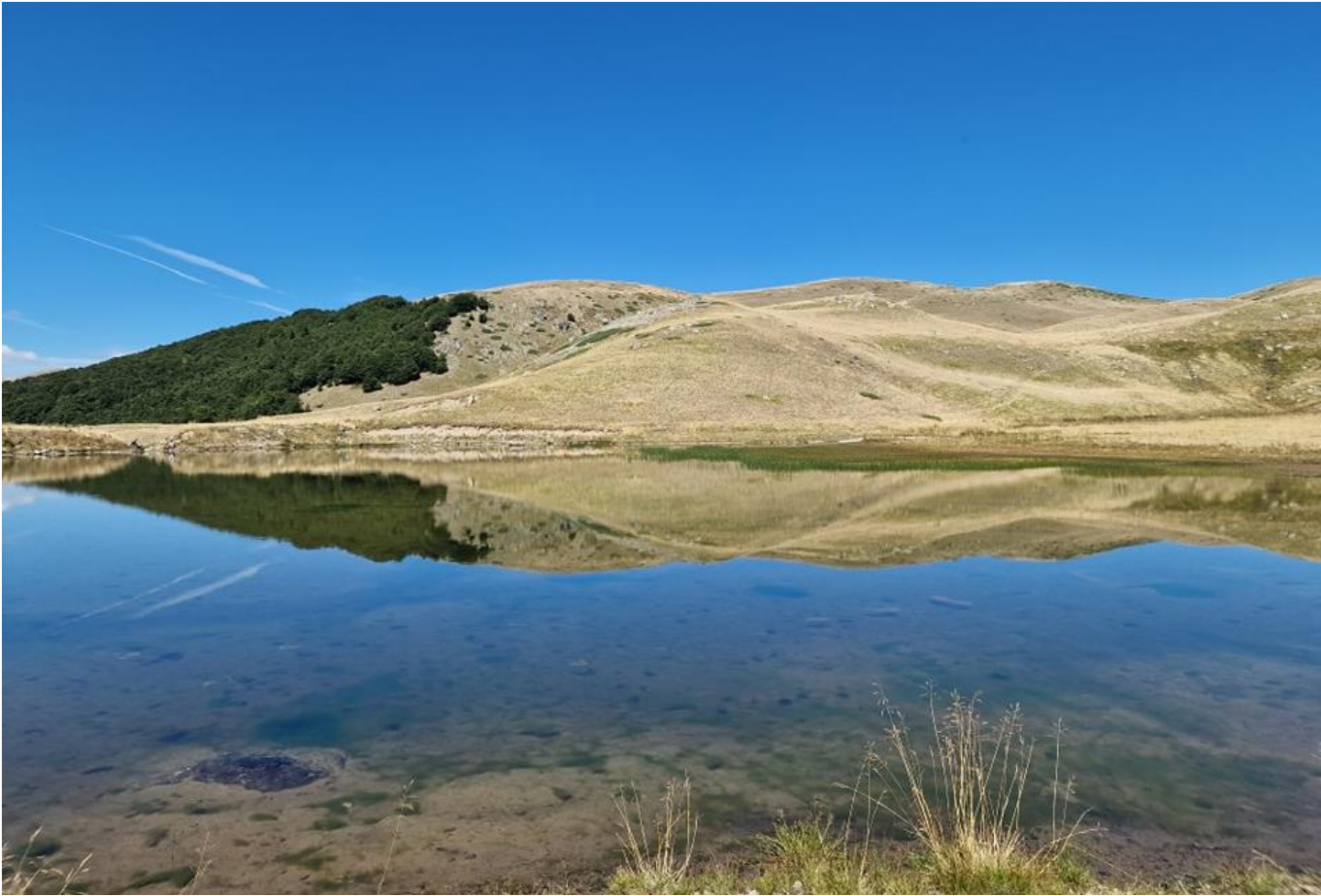
LAKE 3 Albanian site