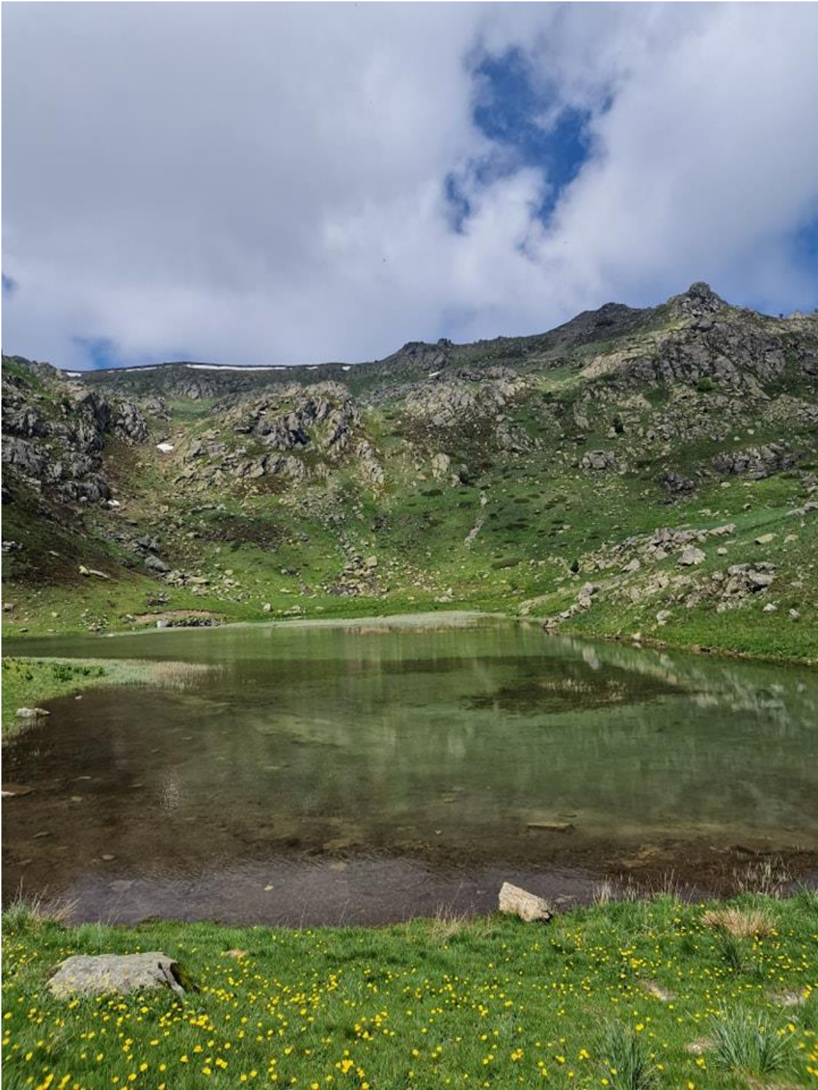
Lake No 1. Labunisko Ezero